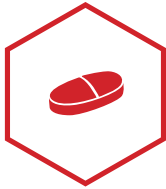
Excipients for Swallow Tablets