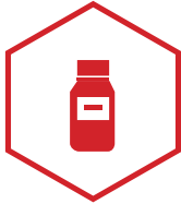
Antacid & Laxative Ingredients