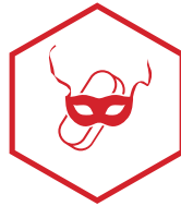
Taste Masked Actives