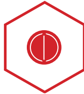
Chevable Tablets & Lozenges